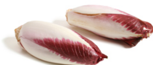
Red Belgium Endive $29.50 / case