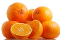
Tangerines $16.50 / case