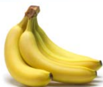
Organic Bananas $25.90 / case