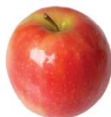
Pink Lady Apples Lunch Box Size $17.50 / case