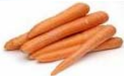
Organic Carrots 25# $16.95 / case