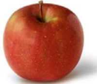
Organic Fuji Apples $31.00 / case