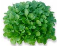
Mache $12.00 / case